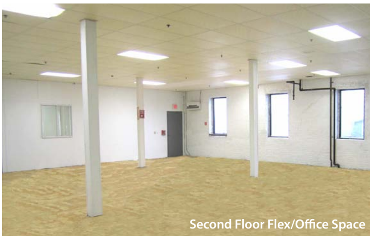
Second Floor Flex/Office Space