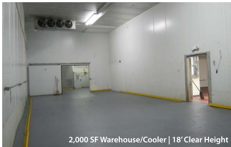
2,000 SF Warehouse/Cooler | 18' Clear Height